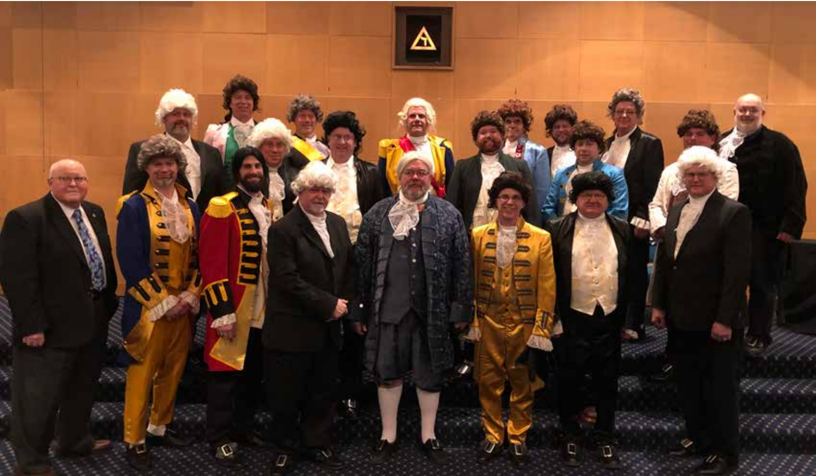
Above: February 21st. Degree night. If you weren't there, you missed a show..