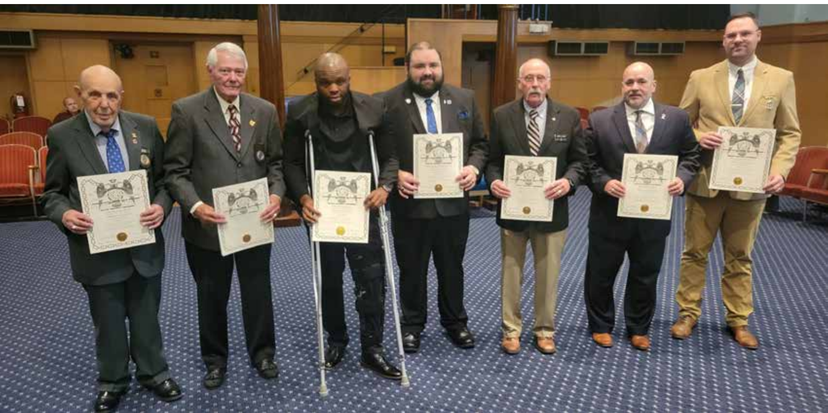
Above: New 32° Scottish Rite Masons from the Valley of Akron.