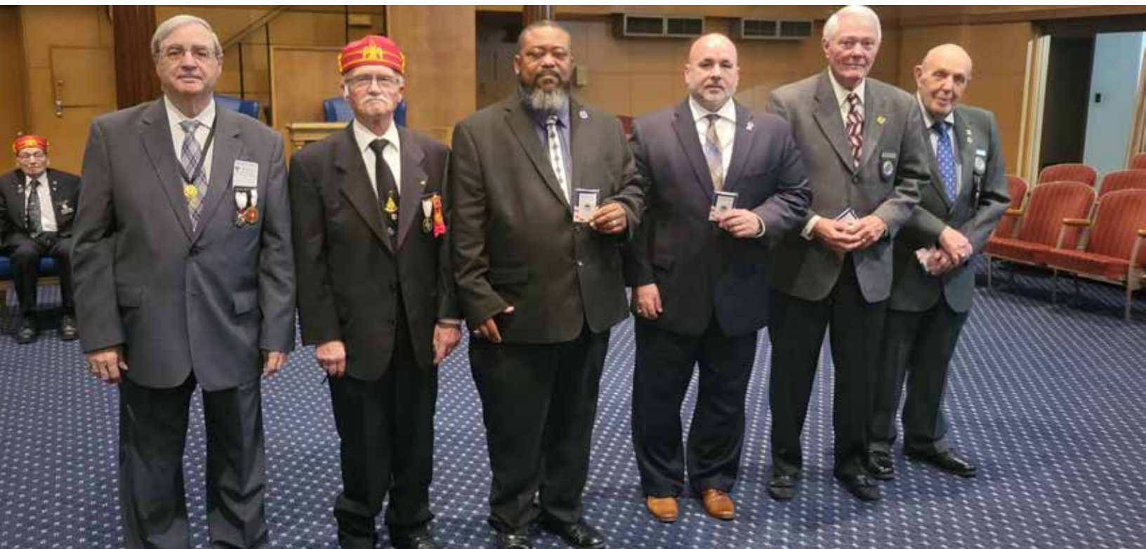
Below: From Veteran's Night recognitions in November, the Sammy L. Davis recipients.